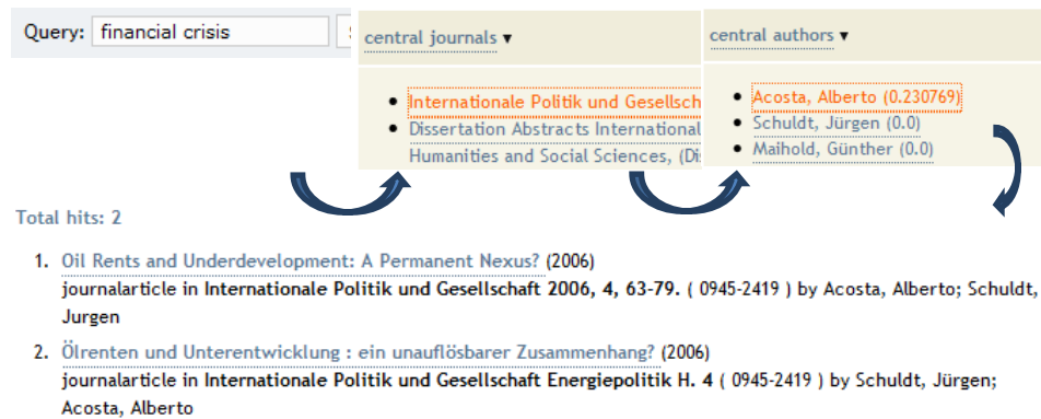
Figure 2: Filter workflow between BRAD and AUTH. Applying BRAD to the result set for ‘financial crisis’ yields the journal ‘Internationale Politik und Gesellschaft’ as the most relevant journal. Applying AUTH to the bradfordized result set yields Alberto as the most central author such that two articles of Acosta published in this journal.

A more sophisticated approach is to create a combined ranking score. As discussed before an inherent problem of both re-ranking mechanisms BRAD and AUTH is the lack of an “inner group” ranking. When a journal is detected as a core journal its corresponding documents are ranked to the top but the rank of each single document within this group is not defined. To solve this problem a combination of the original tf-idf score (mapped on [0,1]) and a journal or author specific weighting factor is applied.